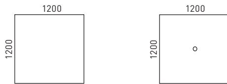
Height adjustable meeting tables with concrete base