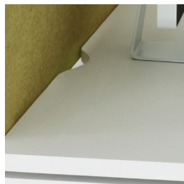
Desktops with a scallop for wire management