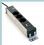
Power socket blocks