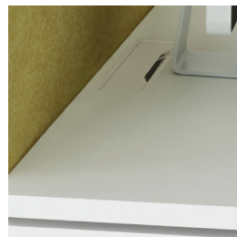
Desktops with a cut-out for grommet and wire management