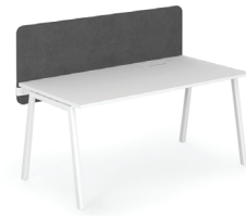
ACTIVE, EASY, T-EASY, ONE, NOVA A