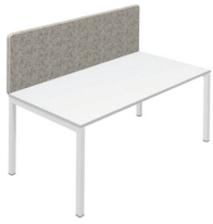
ACTIVE, EASY, T-EASY, ONE, ONE H, NOVA U / H / A / O, NOVA Wood