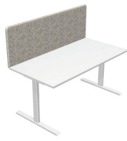
ACTIVE, EASY, T-EASY, ONE, ONE H, NOVA U / H / A / O, AIR, OPTIMA C, OPTIMA PLUS