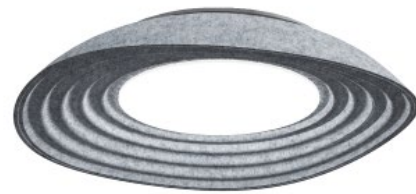
Direct Lighting Option